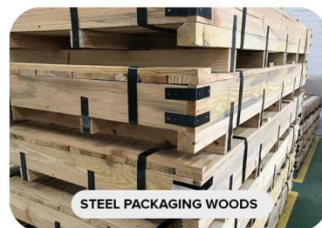
STEEL PACKAGING WOODS