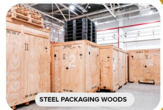
STEEL PACKAGING WOODS